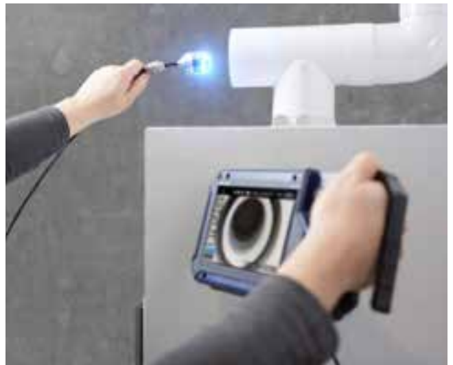
Inspection of flue gas lines from \varnothing 56 mm: easily negotiates tight bends of 87^\circ