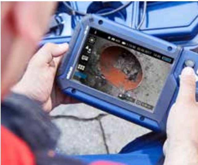
Sharp picture, clear menu and comfortable to hold