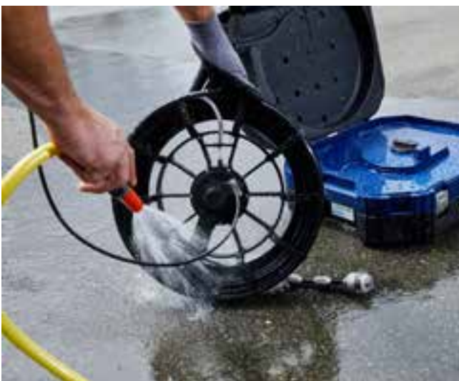
Fast cleaning for lasting hygiene: Simply splash the robust case and the viper with water.