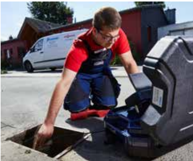
Secure drain inspection with the waterproof camera head