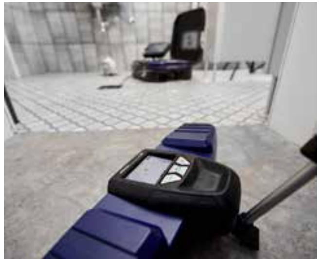
Precise location of the camera head with the Wöhler L 200 Locator