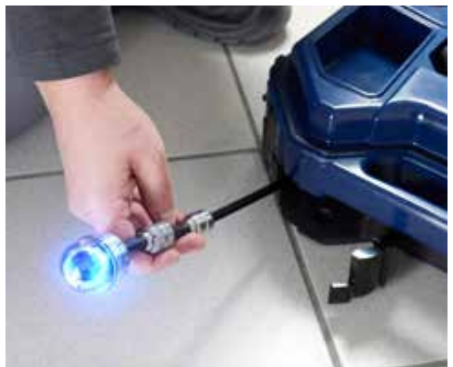
The 30 m camera rod is at the same time flexible and durable because of its construction